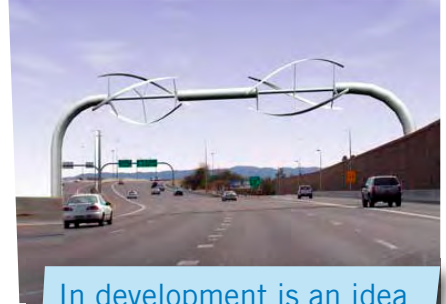
In development is an idea for wind turbines that can be placed over roads to capture wind generated from passing cars