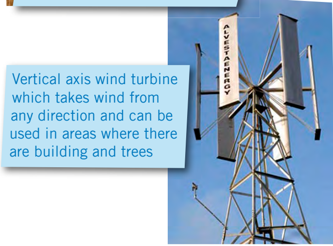
Vertical axis wind turbine which takes wind from any direction and can be used in areas where there are building and trees