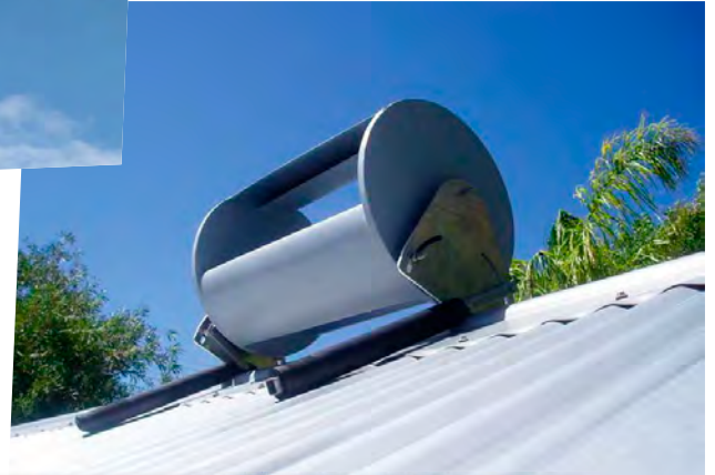
Roof top turbine which sends the electricity it produces straight into the house to be used