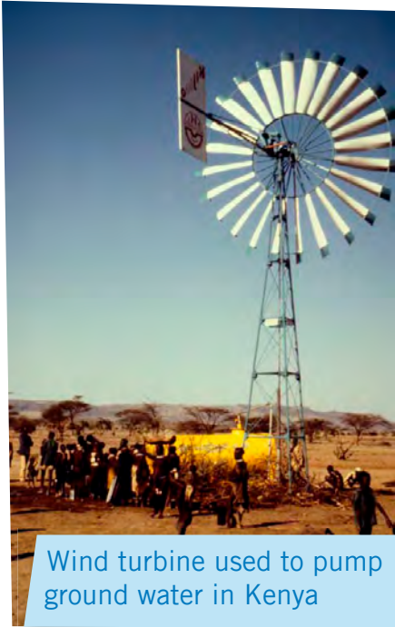
Wind turbine used to pump ground water in Kenya