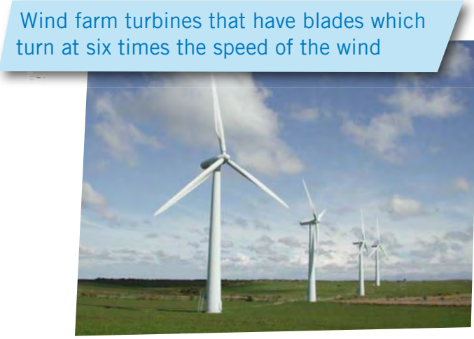
Wind farm turbines that have blades which turn at six times the speed of the wind