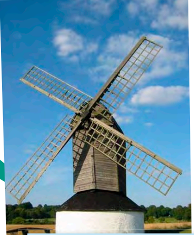
Traditional windmill used to grind flour