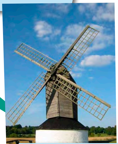
Traditional windmill used to grind flour